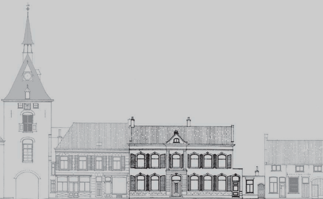
Langendijk 8 - Vianen